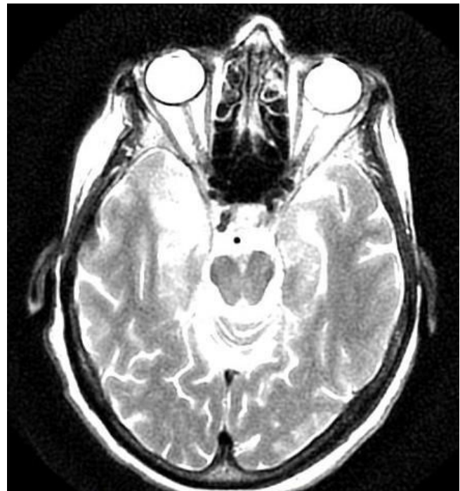
Figure 2 MRI showing abnormal signal intensity involving the medial aspect of the right temporal lobe.

The anti HU syndrome is a neurologic paraneoplastic syndrome. A specific anti body called anti HU is present in serum and CSF of these patients [1]. Patients with anti-Hu